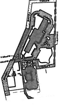
LANDSCAPE BUFFER SCHEMATIC

NOTE: PLANTINGS SHOWN IN PLAN VIEW ARE ILLUSTRATIVE ONLY. ACTUAL PLANTINGS SHALL COMPLY WITH TABULATIONS ON SHEET 4.